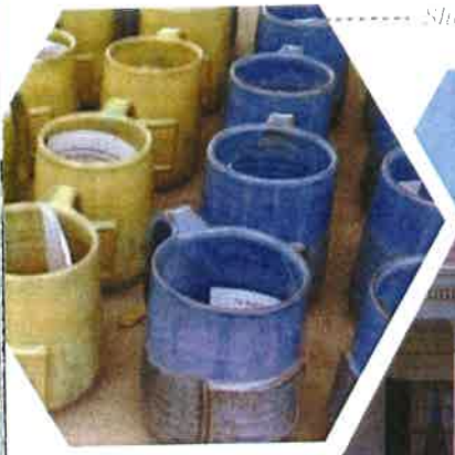
Shearwater Pottery » Ocean Springs