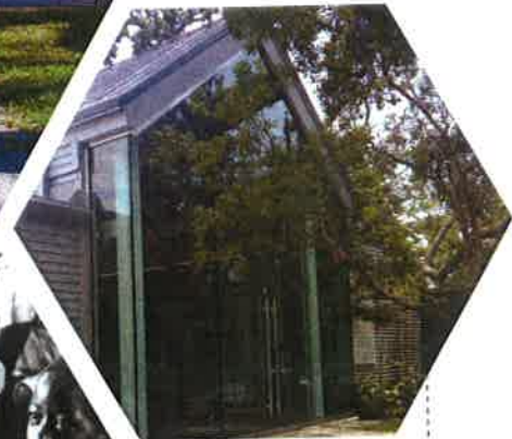
Walter Anderson Museum » Ocean Springs