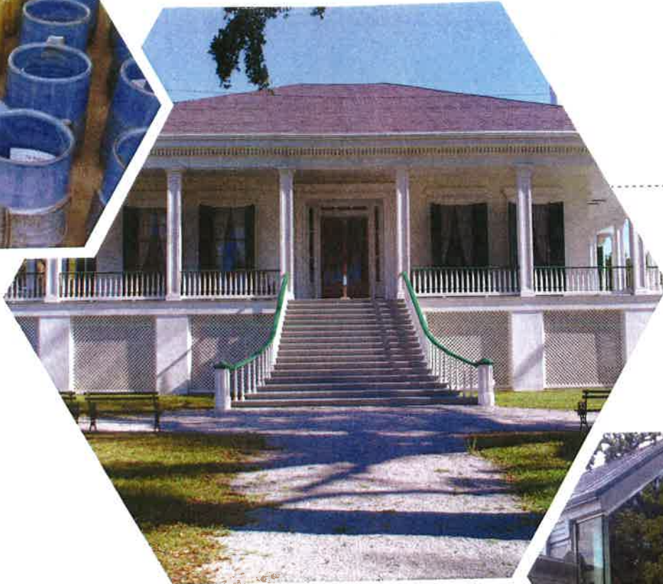
Beauvoir » Biloxi