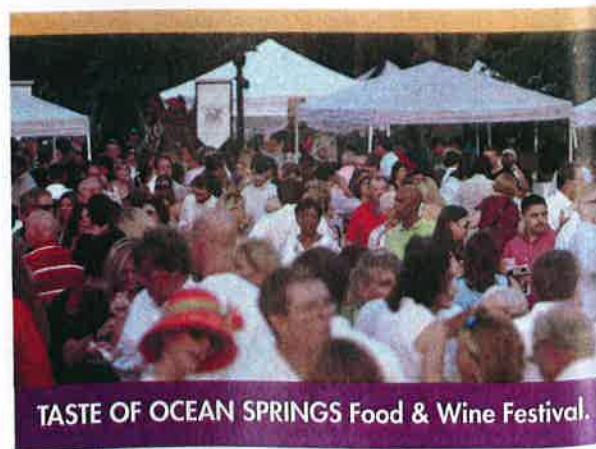
TASTE OF OCEAN SPRINGS Food & Wine Festival.