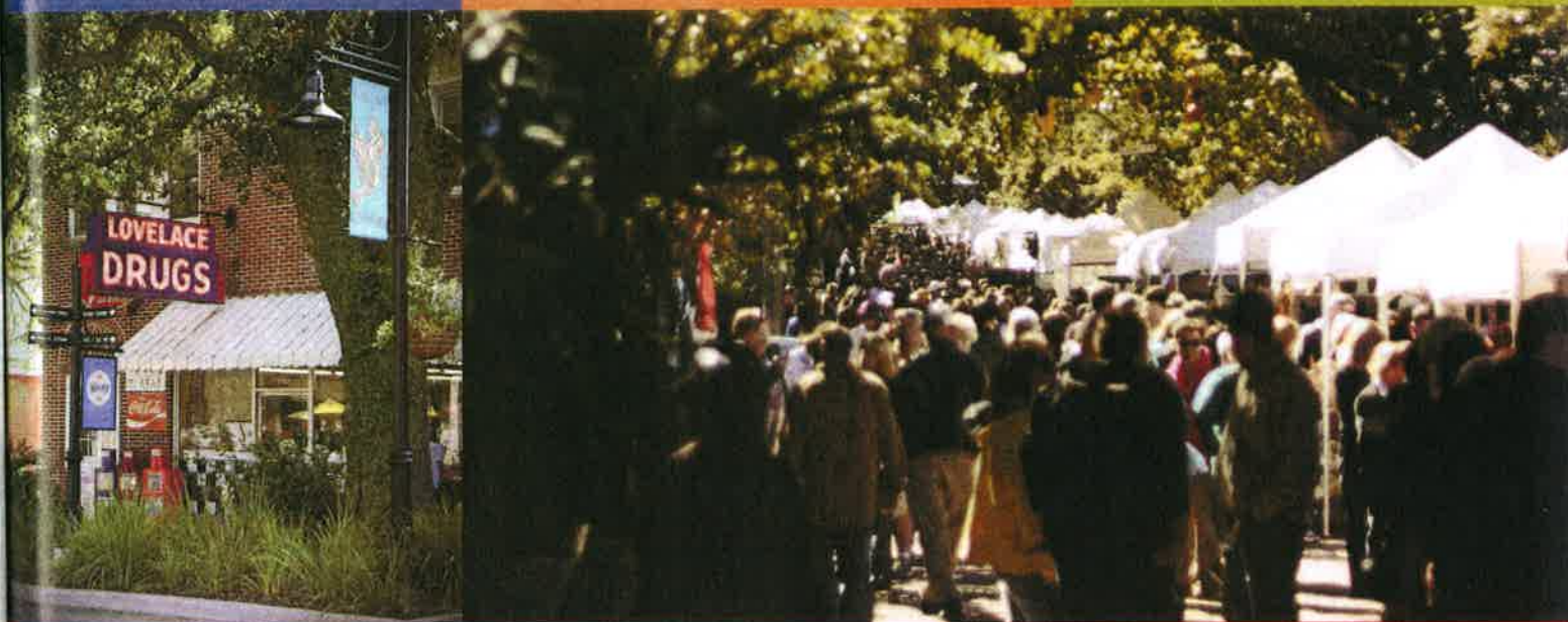
DOWNTOWN Ocean Springs is home to many Coastal icons including the Peter Anderson Festival in the Fall.

Ocean Springs has become a tourist destination and arts mecca statewide, as well as an on regional and national levels. The economic impact of this is evident by the non-existent vacancy rate in the downtown district, which has spurred infill development to meet the demand. The events in the downtown district, led by the nationally acclaimed Peter Anderson Festival , generate more than $30 million in revenue for the City of Ocean Springs annually. And the public/private investment of $523,490,471, over the past 22 years speaks to the dedication of the people of Ocean Springs and the importance they have placed on preservation.