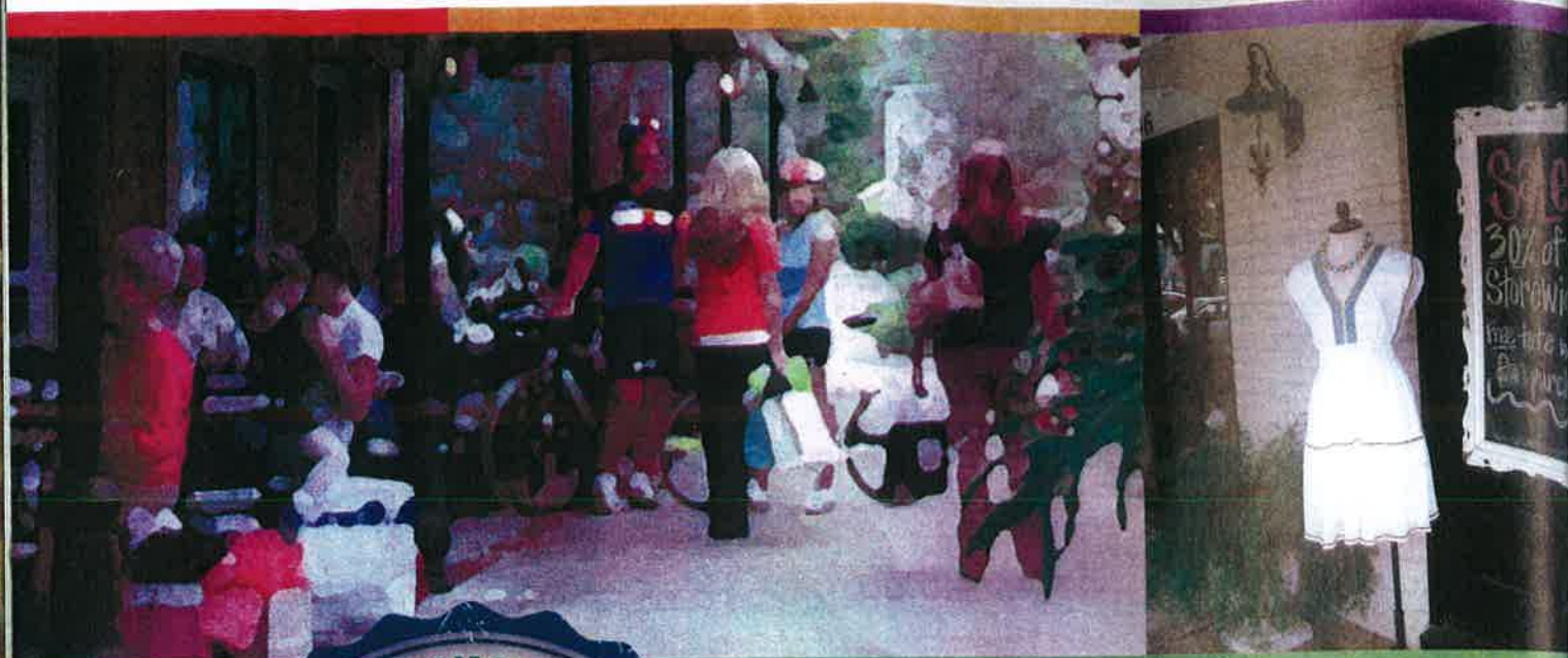
OCEAN SPRINGS won the Great American Main Street Award for 2013.